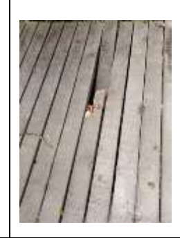
Report Type: Broken Furniture

Broken floor board found on foot bridge inside Crawters Brook park.