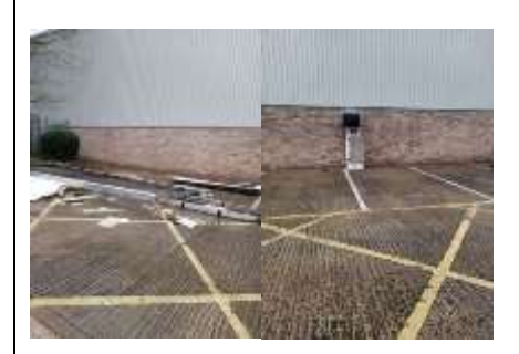
Report Type: Fly Tipping

Details Signs of fly tipping found in places, at the following location (Gatwick Distribution Centre.